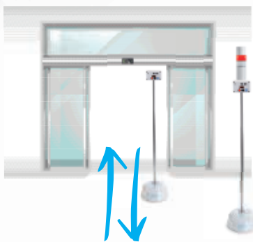
Single door access